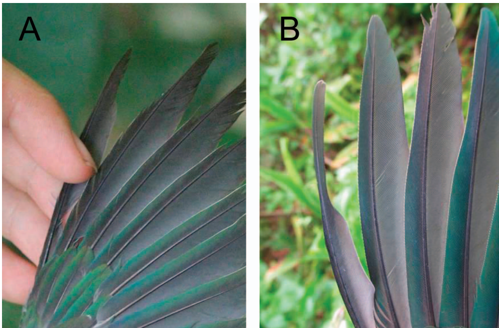
FIG. 1. Shapes of juvenile (left, band # 178375730 captured 19 Mar 2013) and basic (right, band # 085416872 captured 21 Jan 2013) outer primaries (p10) in Purple-capped Fruit-Dove to assist with age determinations. Note also the suspended molt between p7 and p8 on the right-hand image (B), part of a staffelmauser molting pattern, and allowing age-code assignment of DCB (see text).