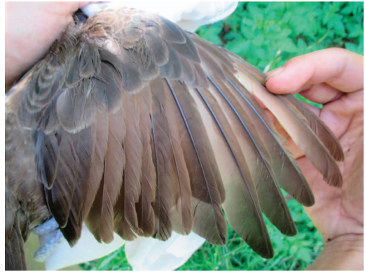
FIG. 7. Samoan Starling (band # 84423051 captured 27 Feb 2015) with growing p2 and p7 (symmetrically on both wings) and showing molt patterns among primaries and secondaries indicating staffelmauser or stepwise molt. Together with other Samoan Starlings as well as Wattled Honeyeaters that have begun prebasic molts with retained inner secondaries (e.g., s5 and s6; see Fig. 6, Table 2L), this suggests that staffelmauser in non-passerines and suspension for molt in passerines may share a common underlying mechanism.

One SAB female and one SAB male showed evidence that retained s5 and/or s6 from one molt could be among the first feathers replaced during the subsequent molt, as noted for Wattled Honeyeater (see Table 2L; Fig. 6), and one DPB female was captured undergoing staffelmauser-like replacement