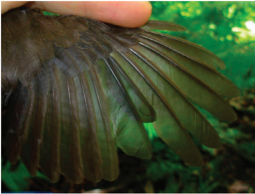
FIG. 3. Samoan Shrikebill (band # 184130591 captured 3 Mar 2014) showing a molt-commencement node at p2 as opposed to p1, with p1 and p4 dropped and p2 longer than p3 (primary scores for this bird are shown in Table 2H). Bilateral replacement from within the primary tract is rare in passerines (see text).

individuals (three SPBs and two DPBs; e.g., Table 2G–H, Fig. 3). Among tertials, a node at t2 was recorded for 11 individuals (e.g., Table 2F–H), whereas no individual showed t1 nodal. In four captures s6 was terminal, although this feather was growing and only slightly shorter (by 0.1–0.2 feather lengths) than s5 on three of these captures. An actively breeding SAB female was captured that had suspended or arrested molt, retaining basic p9–p10 and s5–s6 on both wings (Table 2I) and a second SAB had retained the basic p10 on both wings; this compares with 26 DCBs that had undergone uninterrupted complete molts. Twenty of 38 birds captured in December–March were undergoing active prebasic molt, with molt generally commencing in December–January and completing in March or later, although two UPB individuals had nearly completed molt by mid-January. Mayr (1933) also assumed active molt occurred in January–April based on specimen evidence. Seven females and two males were captured in active breeding condition, all during December or early January, and none of which were simultaneously molting. These data indicate that breeding probably occurs primarily in November–January, followed by the prebasic molt.