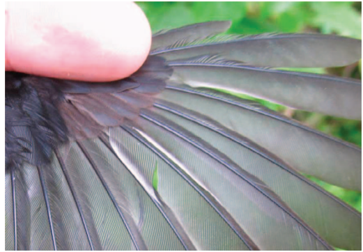
FIG. 4. Formative-plumage (FCF) Cardinal Honeyeater (band # 252158960 captured 23 Mar 2013) showing retention of inner 5 juvenile primary coverts. The browner and more-worn condition of these coverts allows age-determination; older individuals (DCBs) have uniform primary coverts and primaries.

Juvenile (FCJ) Samoan Shrikebills resemble birds in later plumages except for having rufous-fringed wing coverts. FCFs can be identified by thinner and more worn outer primaries and rectrices (see above) as well as molt limits in the upperwing coverts, the retained juvenile greater coverts fringed rufous when fresh, whereas DCBs have