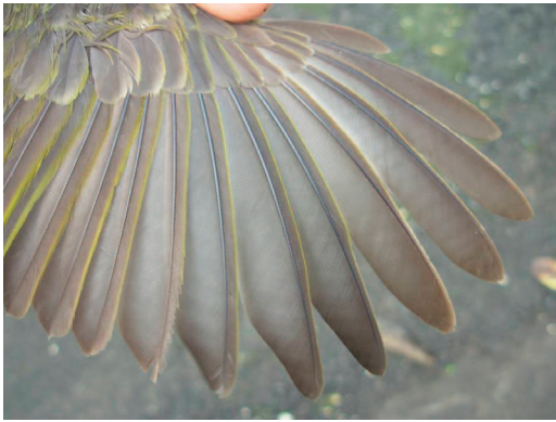
FIG. 5. Wattle Honeyeater (band # 121243359 captured 7 Jan 2014) with evidence of suspended molt; p3–p5 are new, following suspension after p1–p2 had been replaced, and suspending again after p5 had been replaced. The left wing showed a similar pattern except that p2–p5 had been replaced after and before suspensions. Outer primaries are basic so this bird was age-coded SAB.