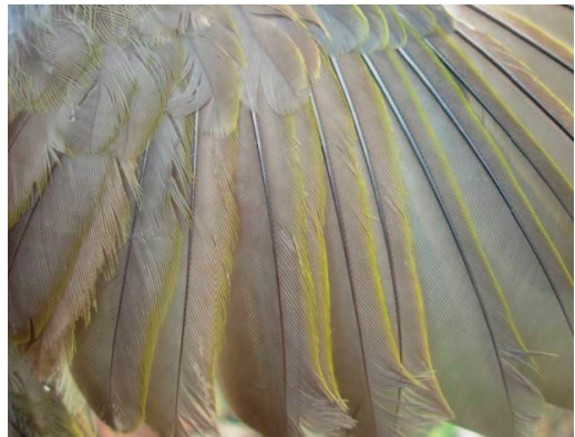
FIG. 6. Wattle Honeyeater (band # 184130549 captured 7 Feb 2014) with growing s5 and old s6, during commencement of a prebasic molt. This molt condition was symmetrical on both wings, and indicates that arrested feathers during one molt can be the first replaced in a subsequent molt in passerines, similar to staffelmauser molt patterns in non-passerines. Four other Wattle Honeyeaters (e.g., Table 2L) and two Samoan Starlings also showed this pattern.

indicated a pattern of protracted molt, many FPFs molting inner primaries in December–March and outer primaries in June–December.