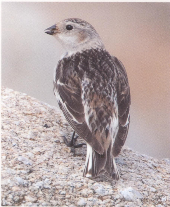
“Featured Photos” (top) by © Eric Kallen of San Diego, California: Snow Bunting ( Plectrophenax nivalis ), Ocean Beach, San Diego County, California, 2 May 2009 and (bottom) by © Brian Sullivan of Carmel Valley, California: same individual, Point Pinos, Monterey County, California, 26 May 2009.