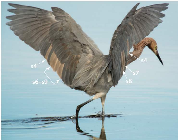
Fig. 3. This Reddish Egret shows five brown retained juvenile secondaries on the left wing (s4 and s6–s9, left to right) and three retained secondaries on the right wing (s4 and s7–s8); such asymmetry in these cases is not uncommon. These secondaries are the last to be replaced in the typical replacement sequence; they are the only juvenile feathers remaining, and allow us to age the bird as a second-cycle individual, as all primaries have been replaced and the body plumage at this age is similar to that of an adult. The brown wash to the median and inner greater coverts represents a predefinitive character; these coverts are the earliest feathers typically replaced during prebasic molts in large birds, and thus often show such characters in second-cycle birds. Merritt Island National Wildlife Refuge, Florida; January 2015.