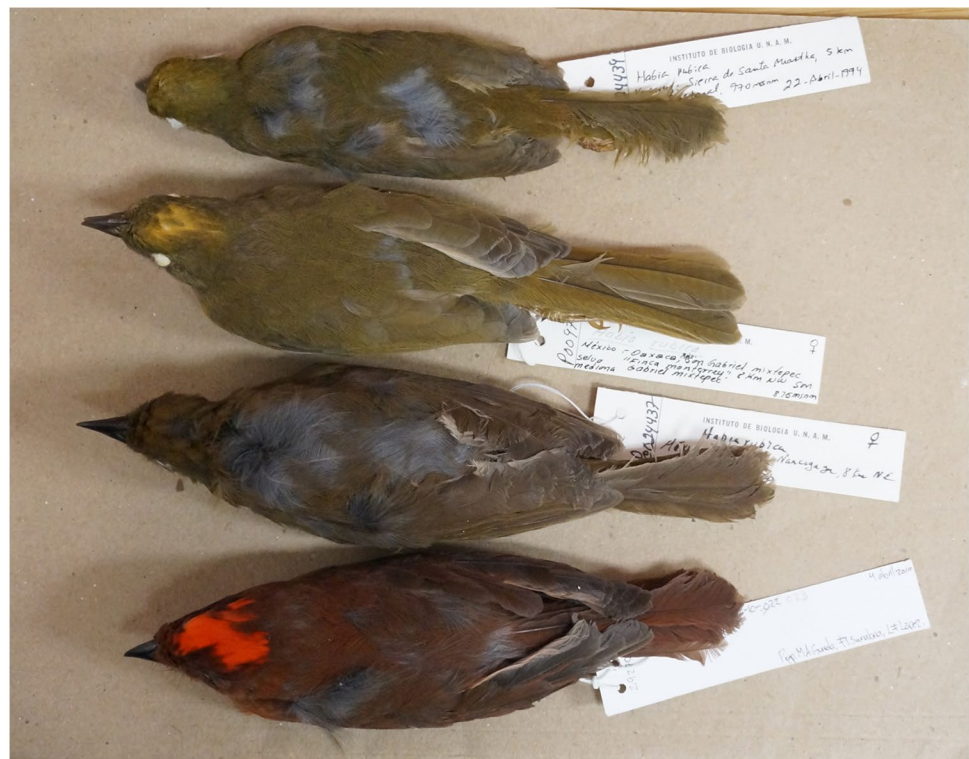
Fig. 1 Development of median-crown stripe in the red-crowned ant-tanager (specimens from Colección Nacional de Aves, Mexico DF). Top to bottom: P0024439 (intermediate; formative female) P009781 (full stripe; definitive female) P0024437 (no stripe; formative female) 29270 (definitive male). Also, notice differences in overall coloration

Median-crown stripe showed ample variation, which we categorized as three obvious variants based on its development (Fig. 1): 0 = no stripe, 1 = intermediate stripe (ill-defined patch with only a mustard wash at base of crown feathers), and 2 = full stripe (well-defined patch with bright yellow crown feathers forming a wide central stripe). We