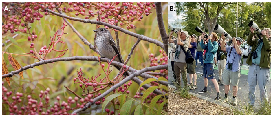
FIGURE 1 | (A) The vagrant Dark-sided Flycatcher in California, here pictured in a fruiting Chinese pistache tree. It fed extensively on these antioxidant-rich fruits; this behavior is associated with recovery from or preparation for extreme exertion—such as a long-distance flight—in other largely insectivorous migratory passerines. (B) Hundreds of birdwatchers converged on the Google campus to view the flycatcher, a first record for temperate North America, over the course of its three-day stay.

Brown Flycatcher ( M. dauurica ) and especially Gray-streaked Flycatcher. The California bird can be identified as Dark-sided on the basis of (1) extensive dark centers to the undertail covert feathers (Figure 2A), as the undertail coverts are unmarked white in both other species (Leader 2010) or rarely with limited dark wash at the bases of the feathers in Gray-streaked, not usually visible in the field and never approaching the extent of darkness visible in the California bird (Alström and Hirschfeld 1991); (2) the pattern of the dark gray-brown chest markings, which grade from rather diffuse mottling at the sides of the chest to neat dark streaking at the center, and are unlike the sharp gray-brown vertical stripes limited to the sides of the chest for which Gray-streaked Flycatcher is named and similarly unlike the uniform brownish wash in that area seen in Asian Brown