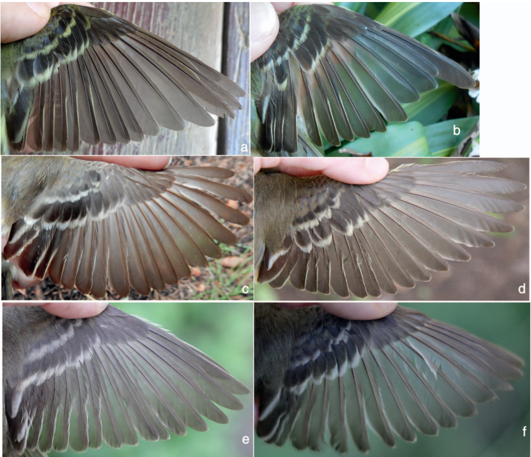
Figure 2. Examples of molts in Yellow-bellied, Least, and Alder flycatchers. (a) Extent of preformative molt in Yellow-bellied Flycatcher on 13 December, after resuming molt on the winter grounds. Formative feathers include lesser, median, and greater coverts, and secondary 8. (b) Eccentric preformative molt overlapping with the first prealternate molt in Yellow-bellied Flycatcher on 31 March on the winter grounds. Primaries 4–8 (but not corresponding primary coverts) are in active preformative molt and inner greater coverts are in active prealternate molt. (c) First prealternate and preformative molt extents in Least Flycatcher on 11 June on the summer grounds. First alternate feathers include secondary 9, inner greater coverts, and inner median coverts; formative feathers include secondaries 6–8 and middle greater covert; juvenile feathers include outer greater coverts, primary coverts, and remainder of remiges. (d) First prealternate and preformative molt extents in Alder Flycatcher on 11 July on the summer grounds. Secondary 9 is alternate; lesser, median, and greater coverts, and all remaining remiges, are formative; primary coverts are juvenile. (e) Definitive prealternate molt extent in Alder Flycatcher on 21 June on the summer grounds. Definitive alternate feathers include the innermost greater covert and secondaries 8–9. (f) Partial preformative molt extent shown by Alder Flycatcher on 23 June on the breeding grounds. Secondaries 8–9 and greater covert 7 are alternate; the outer 2 greater coverts, primary coverts, and remaining remiges are juvenile; all other feathers are formative.

only a partial preformative molt including 8–10 greater coverts and s8–9, but no other remiges or rectrices (Fig. 2f). No birds were observed to replace any primary coverts during the preformative molt.