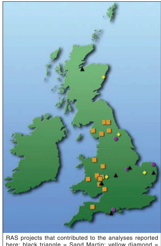
here: black triangle = Sand Martin; yellow diamond = Swallow; purple circle = House Martin; orange square = Pied Flycatcher. These are a small subset of around 100 projects currently active across Britain & Ireland.

We also looked at adult survival rates in the three hirundine species: Sand Martin, House Martin and Swallow. Sand Martin is the second most popular species for RAS projects, and capture totals can be well into treble figures each year. Although we have fewer sites for the other two species, and each site tends to catch fewer birds, we can estimate survival rate reasonably well for these too (Figure 3). Average survival rates over the whole period are broadly similar to those in Pied Flycatcher, probably because all four are trans-Saharan migrants (we might expect annual survival rates of resident birds to be around 50-60%). The estimate for House Martins, averaging 28% over all years, does seem to be rather lower, however. This might be