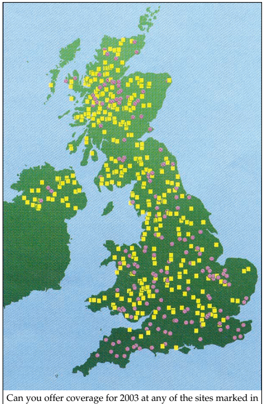
Can you offer coverage for 2003 at any of the sites marked in yellow? (pink = sites already covered)

This project is funded by the Environment Agency.