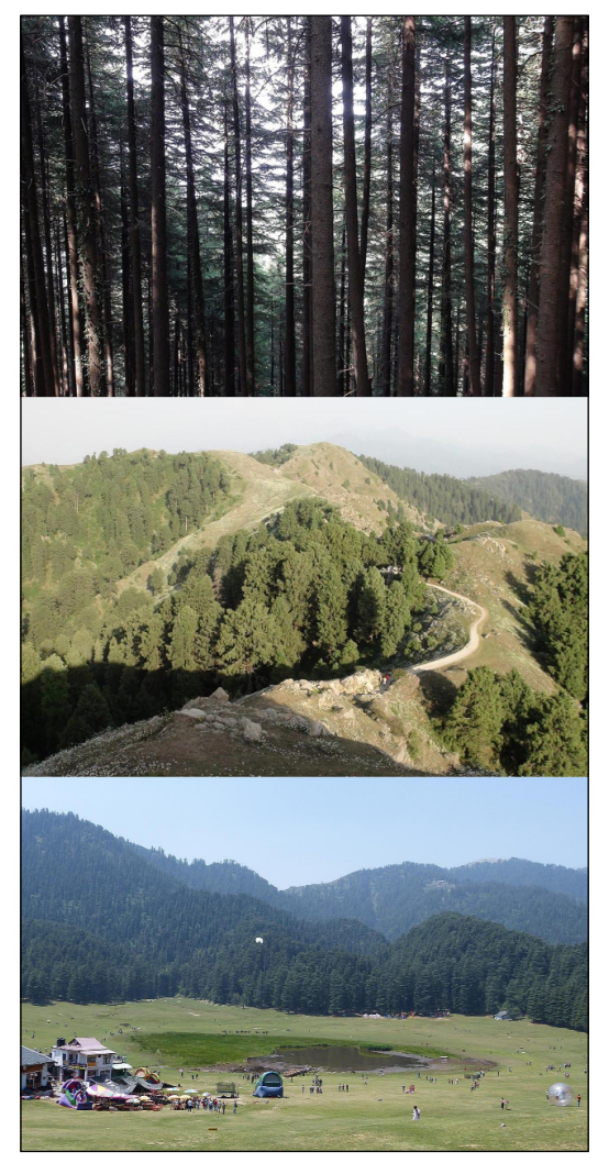
FIGURE 2. Different types of habitats in the study area: Top, thick forest of Cedar; middle, mixed alpine forest with meadows and, bottom, Khajjiar Lake.

two including a new record. Our observations revealed that Koklass Pheasant is a common resident. However, sightings were not frequent owing to the skulking behavior of the species, and its limited, fragmented population. Often, it exhibits its presence through species specific, loud advertisement calls. Three to four calls/min were produced. It was recorded on Kalatop-Lakarmandi-Dainkund trails.