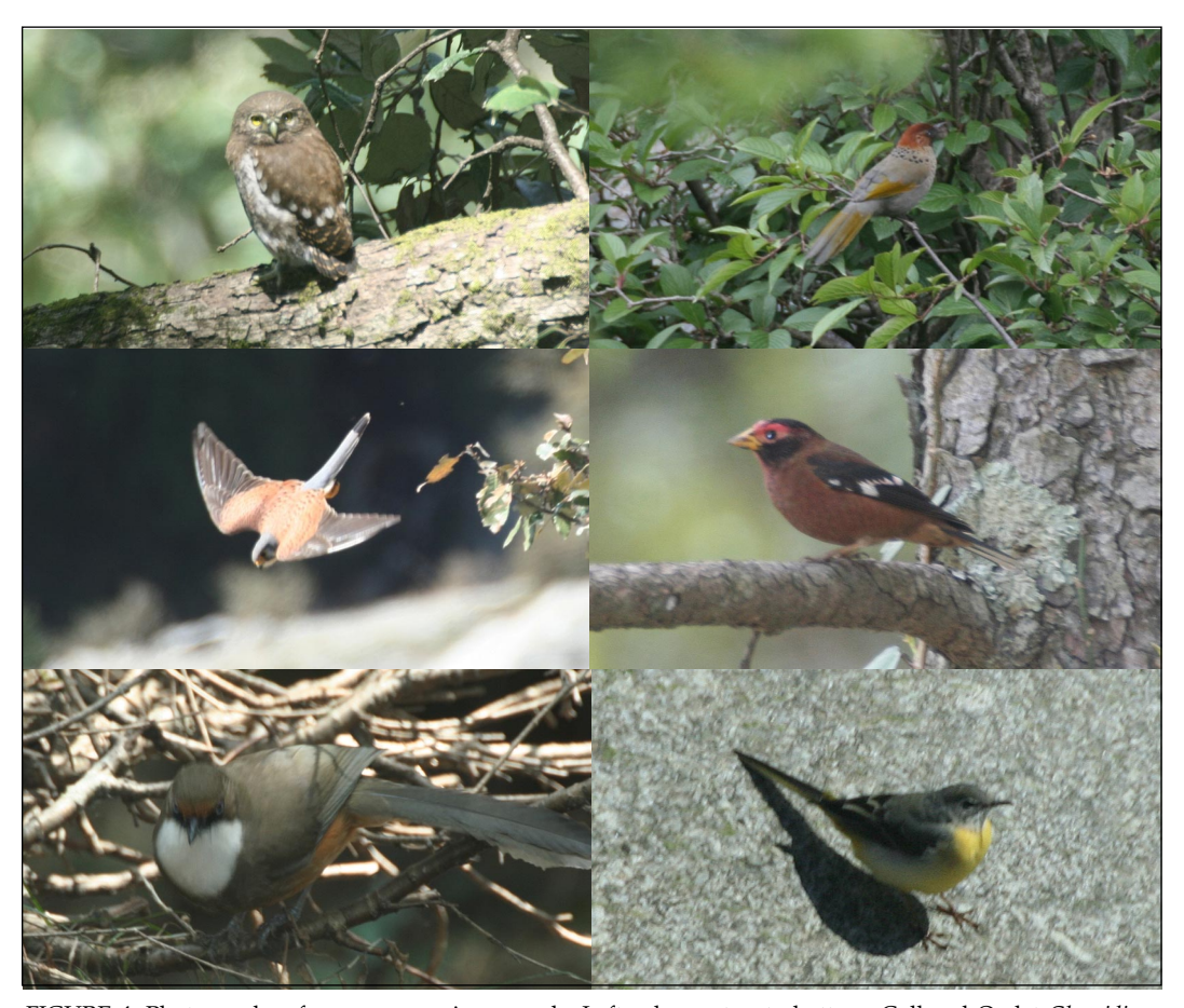
FIGURE 4. Photographs of some new avian records. Left column, top to bottom: Collared Owlet Glaucidium brodiei , Common Kestrel Falco tinnunculus , White-throated Laughingthrush Garrulax albogularis ; right column, Chestnut-crowned Laughingthrush Trochalopteron erythrocephalum , Spectacled Finch Callacanthis burtoni and Grey Wagtail Motacilla cinerea .