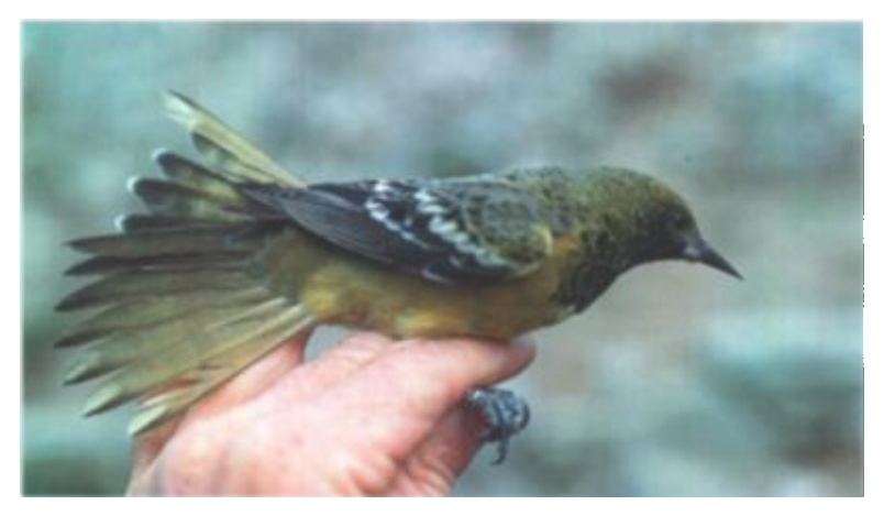
Figure 5. Scott's Oriole, Southeast Farallon Island, 10 November 1993. Two Scott's Orioles arrived on Southeast Farallon in 1993, representing the species' second and third island records.