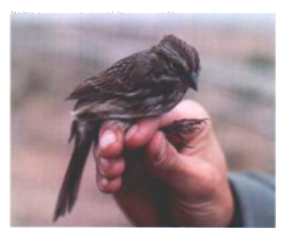
Figure 4. Song Sparrow, Southeast Farallon Island, 15 October 1995. This individual was identified by measurements and plumage as the subspecies Melospiza melodia kenaiensis , breeding in south-central Alaska. There are no published records of this subspecies as far south as California.