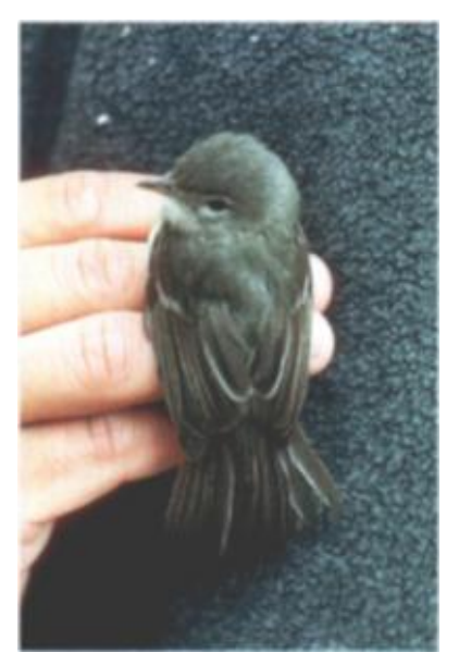
Figure 3. Bell's Vireo, Southeast Farallon Island, 18 September 1993. Two individuals of this species arrived within three days in 1992 and represent the only records of it for the island. This one appears too green to have been the California subspecies, the Least Bell's Vireo, Vireo bellii pusillus.