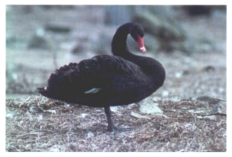
Figure 6. Black Swan, Southeast Farallon Island, 21 September 1991. This individual, presumably an escapee from captivity, was very tame, accepting hand-offered food. It died on the island on 25 September.