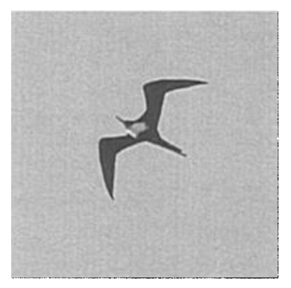
Figure 2. Adult female Great Frigatebird, Southeast Farallon Island, 14 March 1992. This was the first Great Frigatebird accepted for California and still one of only two.

Red-breasted Merganser—The arrival pattern of this species is perhaps more accurately represented by a single over-winter peak (mean arrival 31 December \pm 46 days).