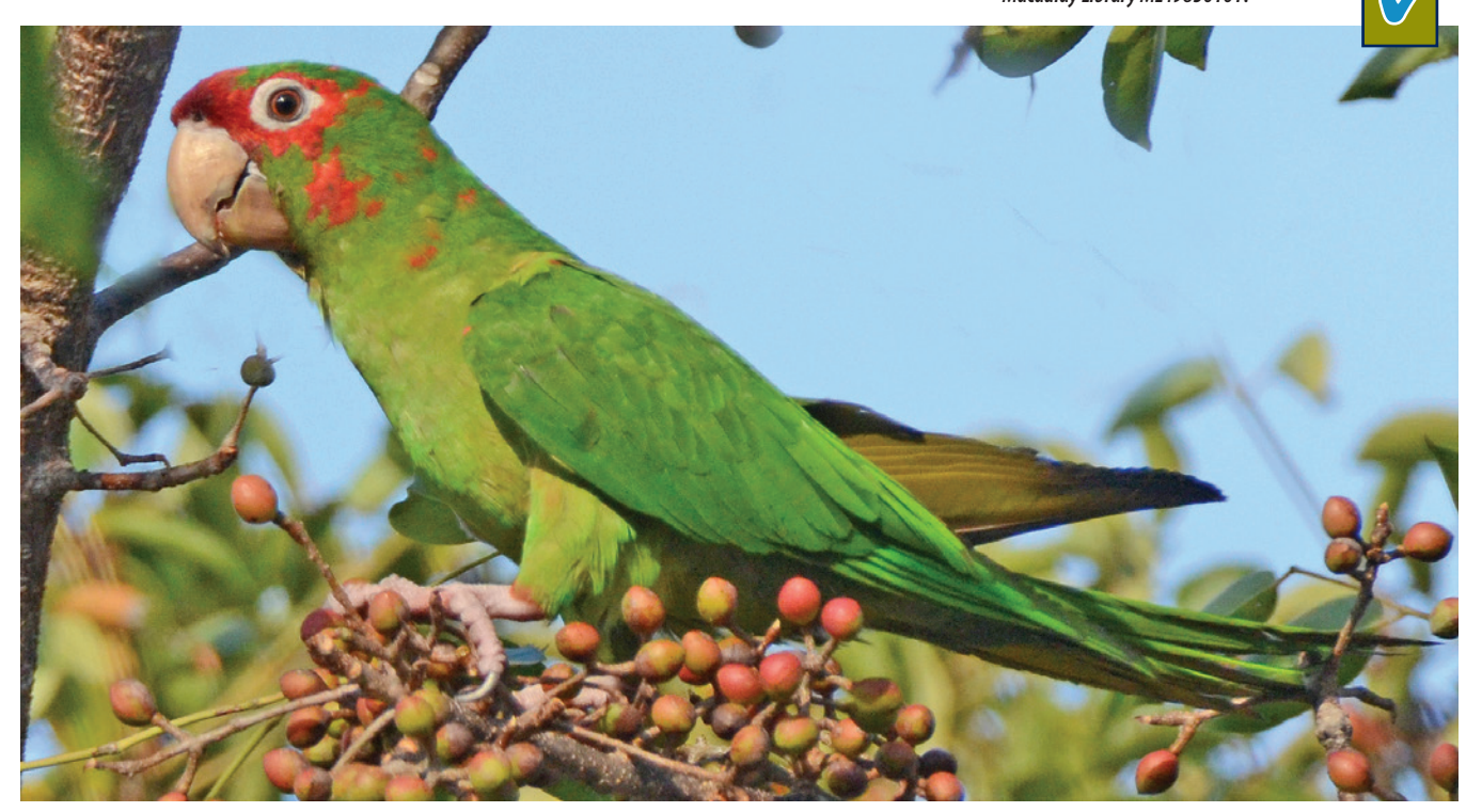
Figure 4. Mitred Parakeet. Kendall, Miami-Dade Co, Florida. 21 Mar 2015. The ABA-CLC added this exotic species to the ABA Checklist based on established breeding populations in Florida. The relatively restricted amount of red to the crown and face and the lack of red to the marginal lesser coverts (the "bend of the wing") help distinguish Mitred Parakeet from the similar Redmasked Parakeet (cf. Fig. 8), which has breeding populations in California and Hawaii. Red-masked Parakeet may someday also be accepted to the ABA Checklist.

Mitred Parakeet ( Psittacara mitratus )—ABA-CLC Record #2020–07 (8–0, Feb 2021). This species has substantial breeding populations in both Florida and California (>500 individuals each) and was accepted as an established exotic species by AOS in 2002 (Banks et al. 2002). Pranty and Garrett (2011) discussed this species' status in regard to its addition to the ABA Checklist and indicated that the ABA-CLC would prefer to await endorsement of popula-