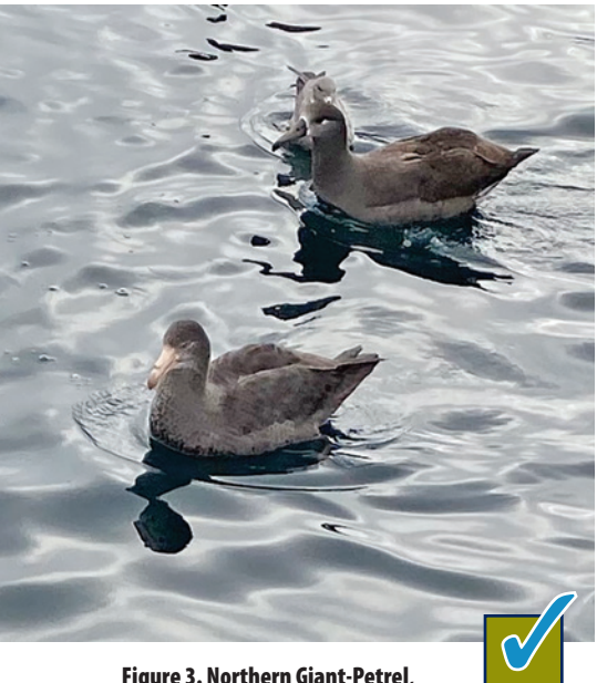
Figure 3. Northern Giant-Petrel, with Black-footed Albatrosses and a

Northern Fulmar, off Ocean Park, Pacific Co, Washington. 8 Dec 2019. The rather fresh and dark plumage (as opposed to grizzled white feathering on the face and chin) and dark eye indicate a younger individual, perhaps in juvenile or formative plumage. The dark maroon bill tip is diagnostic of Northern Giant-Petrel and eliminates Southern Giant-Petrel ( M. giganteus ), which has a palegreen bill tip at all ages.