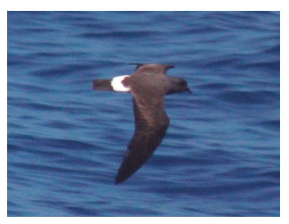
FIG.L This Hawaiian Band-rumped Storm-Petrel is a moderately worn adult. The upper-wing ulnar bar appears to become less distinct with wear, and the indistinct bar on this

FIGS.K Shown here are two of 15 breeding adult Hawaiian Band-rumped Storm-Petrels captured near a suspected breeding colony on Kaua'i. These birds were banded as part of the Kaua'i Endangered Seabird Recovery Project (kauaiseabirdproject.org), which focuses on learning about the breeding distribution and ecology of this little-known species in Hawaii. All 15 birds were at least two years old based on molt clines, and all 15 had brood patches. Note that the plumage is moderately worn on this date, reflecting molt that completes in the spring. The upper-wing ulnar bars of both individuals are indistinct, reflecting moderate plumage wear; and note also the wide dark tips to the upper-tail coverts in Fig. K2.