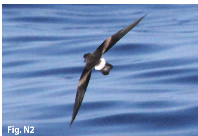
Off Kona, Hawai'i, October 27, 2013 ( Fig. N1 ) and October 29, 2011 ( Fig. N2 ).

bird may be typical of more-worn plumage. Note also the distinctive bracketed shape to the distal ends of both the dark rump and the white upper-tail—covert patch, perhaps reflecting these patterns on the longer central feathers in these tracts. We have noticed this bracketed shape in other Hawaiian Band-rumped Storm-Petrels (see Fig. M3) and have found it useful at times in identification.