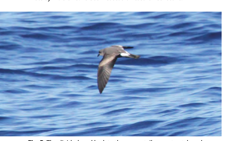
Fig. B. The divided-oval look to the upper-tail–covert patch and longish tail might suggest that this is a Leach's Storm-Petrel, but careful analysis of all 122 photos of this bird (compare with Fig. C) indicate that it is a Band-rumped Storm-Petrel , apparently a recently-fledged juvenile. Enlargement of the images indicates that the longest upper-tail coverts are broadly tipped black. Note also the rather indistinct upper-wing ulnar bar. Off Kona, Hawai'i Island; October 29, 2011.