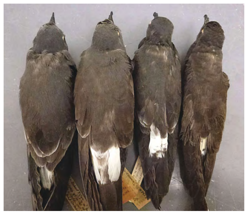
Fig. E1 (below): Specimens collected in or near the Hawaiian Islands. Left to right October 4, 1906; September 3, 2001; July 12, 1893; December 29, 1997; December 24, 2003; and March 10, 1892. Fig. E2 (above): Specimens collected, left to right, off California, October 4, 1950; off Alaska, June 17, 1896; in the Galápagos Islands, August 13, 1906; and near the Galápagos Islands, May 8, 1906.

of Band-rumped) show the affects of age and wear on plumage tone. Direct comparison of specimens indicates that fresh juveniles of both species (BPBM 185162 and 184055 and CAS 61107 and 514) are the same shade of sooty gray, fresh adults of both species (BPBM 184416 and 184591) are the same shade of very dark brown, and worn juveniles or adults of both species (BPBM 156975 and 7559 and CAS 43459 and 499) can be the same shade of paler brown, at least in the Pacific.