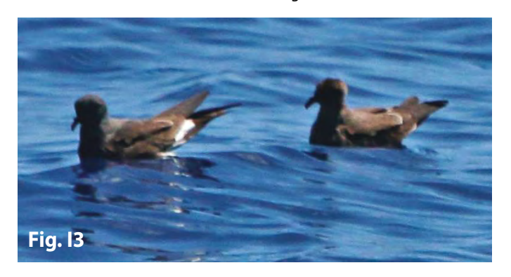
Fig. I1: Kaua'i, October 4, 2006, left, and Hawai'i, September 3, 2001, right (BPBM 185162 and 184416, respectively). Fig. I2: Alaska, June 17, 1896 (CAS 43459). Fig. I3: off Kona, Hawai'i, April 26, 2015.

On a cautionary note, we have photographed adult Leach's with Band-rumped–like bars (Fig. J2) and Band-rumps with more prominent bars (see Figs. M–O). Interestingly, the bars tend to become less prominent with wear, on average more-distinct in fresh juveniles and adults and less-distinct in worn birds, perhaps opposite to what might be expected. As mentioned above, we have noticed in CRC