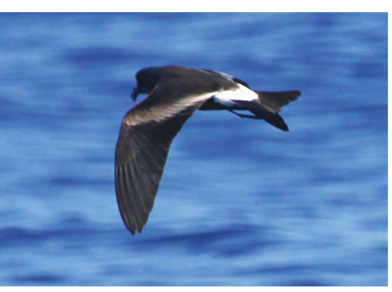
Fig. A. This is the same bird as that shown in the Featured Photo. The shape and division of the upper-tail–covert patch and the forked tail more clearly indicate this to be a Leach's Storm-Petrel . The degree of tail spread, the position and torque of flight, and the angle of the bird relative to the camera can all greatly affect the appearance of the tail fork in these species. Note also the distinct upper-wing ulnar bar in fresh plumage, further supporting the identification. But also note that the white upper-tail area wraps around to the under-tail coverts, a mark ascribed more to Bandrumped Storm-Petrel. Off Kona, Hawai'i Island; November 8, 2015.