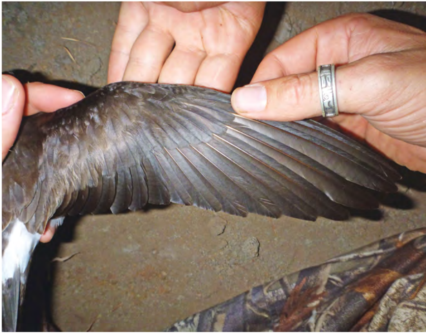
Figs. K1, K2 : Along the Na Pali Coast, Kaua'i, August 23, 2012.