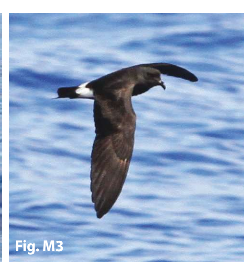
Off Kaua'i, September 4, 2015 ( Figs. M1, M2 ) and September 10, 2015 ( Fig. M3 ).