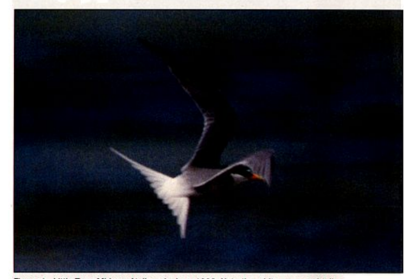
Figure 1. Little Tern, Midway Atoll, early June 1999. Note the white rump and tail contrasting crisply with the gray back, and the reduced amount of dark to the inner webs of the middle primaries.

The only records of Little Tern in the area covered by the AOU (1998) involve two specimens of the Asiatic subspecies (S. a. sinensis) and several sight and photograph records from the Northwestern Hawaiian Islands (NWHI; Clapp 1989, Conant et al. 1991, Pyle, pers. obs.). In the Hawaiian Islands overall, members of this species-pair have been observed annually since at least 1976, with up to 6 recorded at once and as many as 10–12 different individuals observed within a year (Clapp 1989, R. Pyle, pers. comm.). Records are from late March to early December, with the majority from June through October. Evidence of breeding has been reported from Oahu in 1984 (R. Pyle pers. comm.), French Frigate Shoals, NWHI, in 1980 (Pyle 1980), and Pearl and