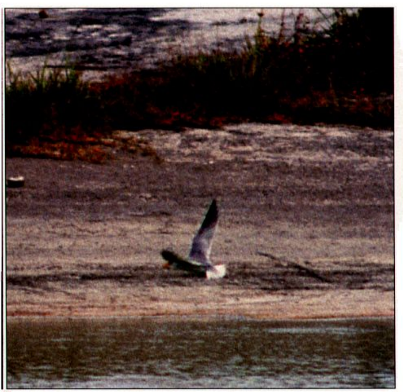
Figure 5. Least Tern, Midway Atoll, 24 June 1999. Note the gray rump and tail, concolorous with the rest of the upperparts, and the extensive amount of dark coloration to inner webs of the middle primaries. Photograph by Peter Pyle .