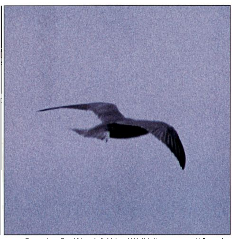
Figure 6. Least Tern, Midway Atoll, 24 June 1999. Note the gray rump and tail, concolorous with the rest of the upperparts, and the extensive amount of dark coloration to inner webs of the middle primaries.