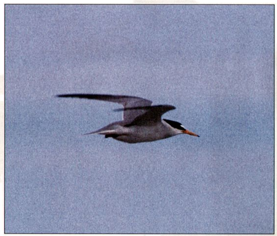
Figure 4. Least Tern, Midway Atoll, 24 June 1999. Note the relatively short outer rectrices and gray rump and tail, concolorous with the rest of the upperparts.