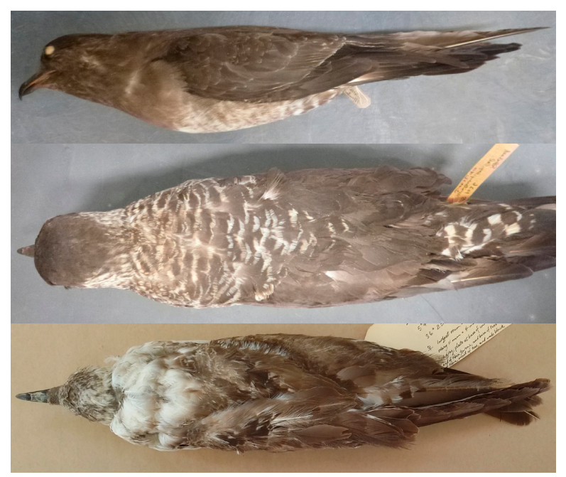
Figure 6. Specimens of jaegers collected during their second fall and winter. Top, Long-tailed Jaeger (CAS 16402) collected in Monterey Bay, California, 4 October 1909; center, Parasitic Jaeger (MVZ 17834) collected in Monterey Bay, 12 December 1910; bottom, Long-tailed Jaeger (SDNHM 41733) collected 69 km east of Cocos Island off Costa Rica, 26 January 1980. These birds are entirely (top) or primarily in worn formative plumage at ages of 16–19 months with limited replacement of back feathers in second fall in the center and bottom specimens.