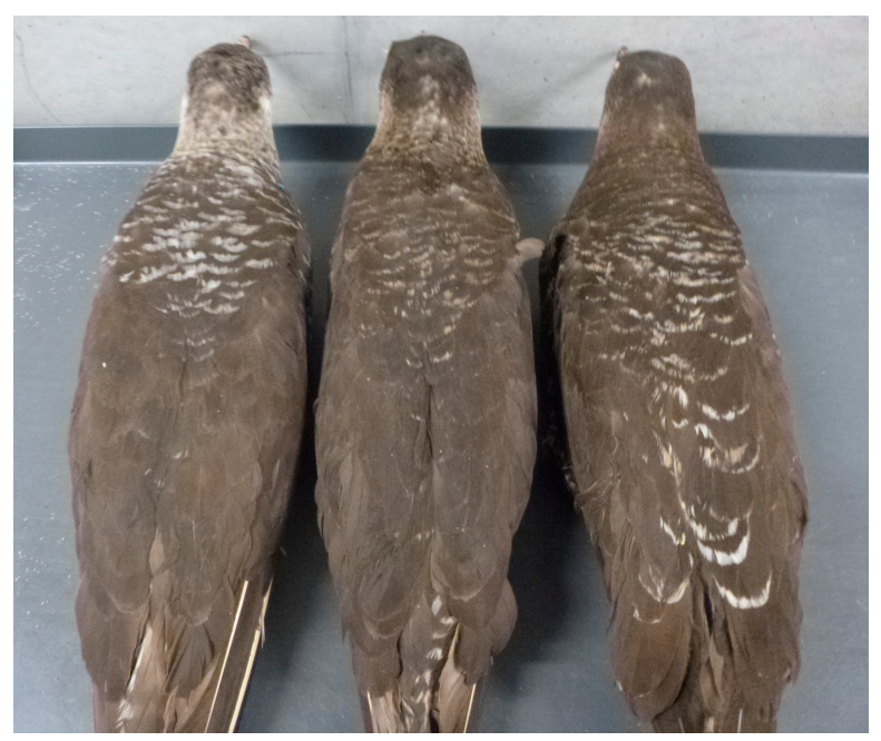
Figure 8. Specimens of winter adult Pomarine Jaegers collected in Monterey Bay, California, showing incomplete definitive fall body-feather molt. Left, CAS 11031, collected 8 November 1907; center, CAS 16399, collected 9 December 1909; right, CAS 16134, collected 13 December 1909. From left to right, the progression of molt of the primaries was to p5, p6, and p7, and the proportion of back feathers replaced in the fall body-feather molt was an estimated 40%, 50%, and 80%, respectively.