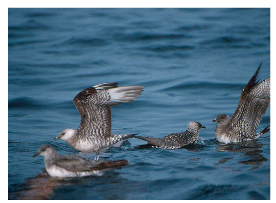
Figure 3. Long-tailed Jaegers, 5 km off Arica, Chile, 2 December 1993 (from left to right, birds DC3, 2C3, DC4, and 1C1 in Table 1). Note the bleached head feathers and underwing pattern of the second-cycle bird (2C3) and the incomplete back molt in the right-hand definitive-cycle bird (DC4).

Adult Long-tailed Jaegers ( Stercorarius longicaudus ) migrate to their arctic and subarctic breeding grounds in fresh "breeding" plumage and return to their Southern Hemisphere winter range in the same plumage. As a result, the species' "nonbreeding" plumages are typically worn only at sea in the Southern Hemisphere and are under-represented in specimen collections. Descriptions and illustrations of the Long-tailed Jaeger's adult nonbreeding plumage are variable and conflicting; most indicate it to resemble the adult breeding plumage, including a blackish cap and pale yellowish to whitish hind collar, but to be muted in color and/or to show indistinct barring to the sides, flanks, and undertail coverts (e.g., Cramp 1983, Higgins and Davies 1996, Malling Olsen and Larsson 1997, Dunn and Alderfer 2011, Sibley