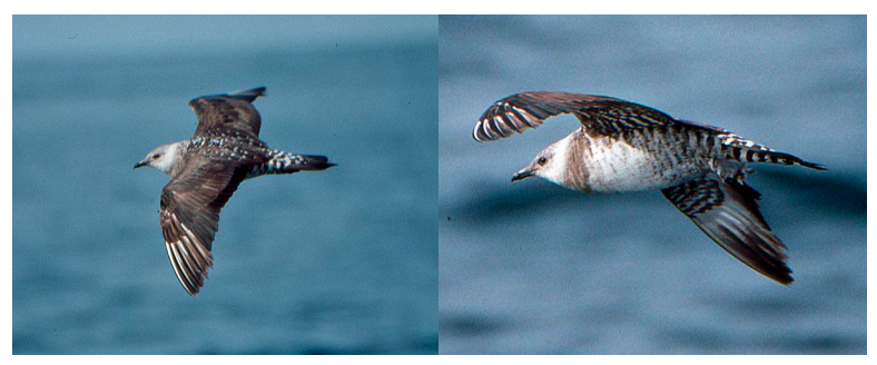
Figure 2. Second-cycle Long-tailed Jaeger, 5 km off Arica, Chile, 2 December 1993 (bird 2C4 in Table 1). Note the bleached head feathers, incomplete back molt, worn pointed central rectrix, and suspension limit between p7 and p8 of the formative plumage.