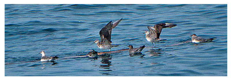
Figure 1. Long-tailed Jaegers, 5 km off Arica, Chile, 2 December 1993, showing variation in nonbreeding plumages of one first-cycle, three second-cycle, one probable third-cycle, and one definitive-cycle birds (from left to right, birds 2C3, 3C1, 2C1, 1C1, 2C2, and DC3 in Table 1). Note the bleached whitish heads of the second-cycle birds.