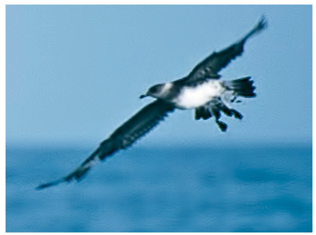
Figure 4. Presumed third-cycle Long-tailed Jaeger, 5 km off Arica, Chile, 2 December 1993 (bird 3C1 in Table 1). Note that the head plumage is darker and barring to the underwing is less extensive than in the second-cycle birds in Figures 1–3. Note also the relatively advanced primary molt (to p6) and the two pairs of barred central rectrices.

Among the 23 photos are 50 depictions of the 11 Long-tailed Jaegers. Careful comparison of plumage, molt progression, and positioning of the birds with respect to the sequence of photographs allowed us to identify each individual with confidence. We designated each individual, by cycle, as 1C1 (first-cycle bird); 2C1, 2C2, 2C3, and 2C4 (second-cycle birds); 3C1 (prob-