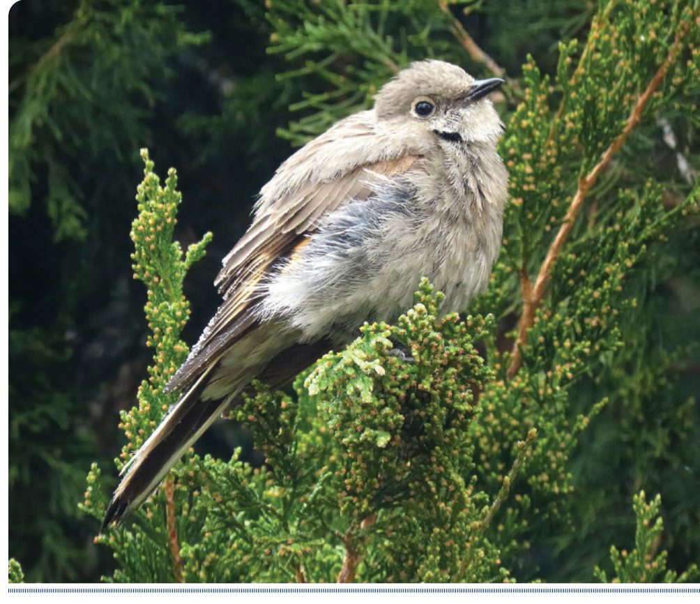
Featured Photo–Townsend's Solitaire. Lafayette, Boulder County, Colorado; Apr. 2, 2019. This bird is easily identified as a Townsend's Solitaire by its upright stature, prominent eye-ring, white outer tail feathers, orange in the wings, and gray–brown tones overall. Plus, it's in a juniper tree, a key microhabitat association for the species. Is there anything left to say? In this installment of the Birding Featured Photo, we venture "beyond bird identification" with an expert on aging and sexing birds, in the process adding depth and dimension to the experience of birding.

Now, Townsend's Solitaires usually don't nest until May, so the fact that the individual pictured in the Facebook post appears to already be in breeding condition at the