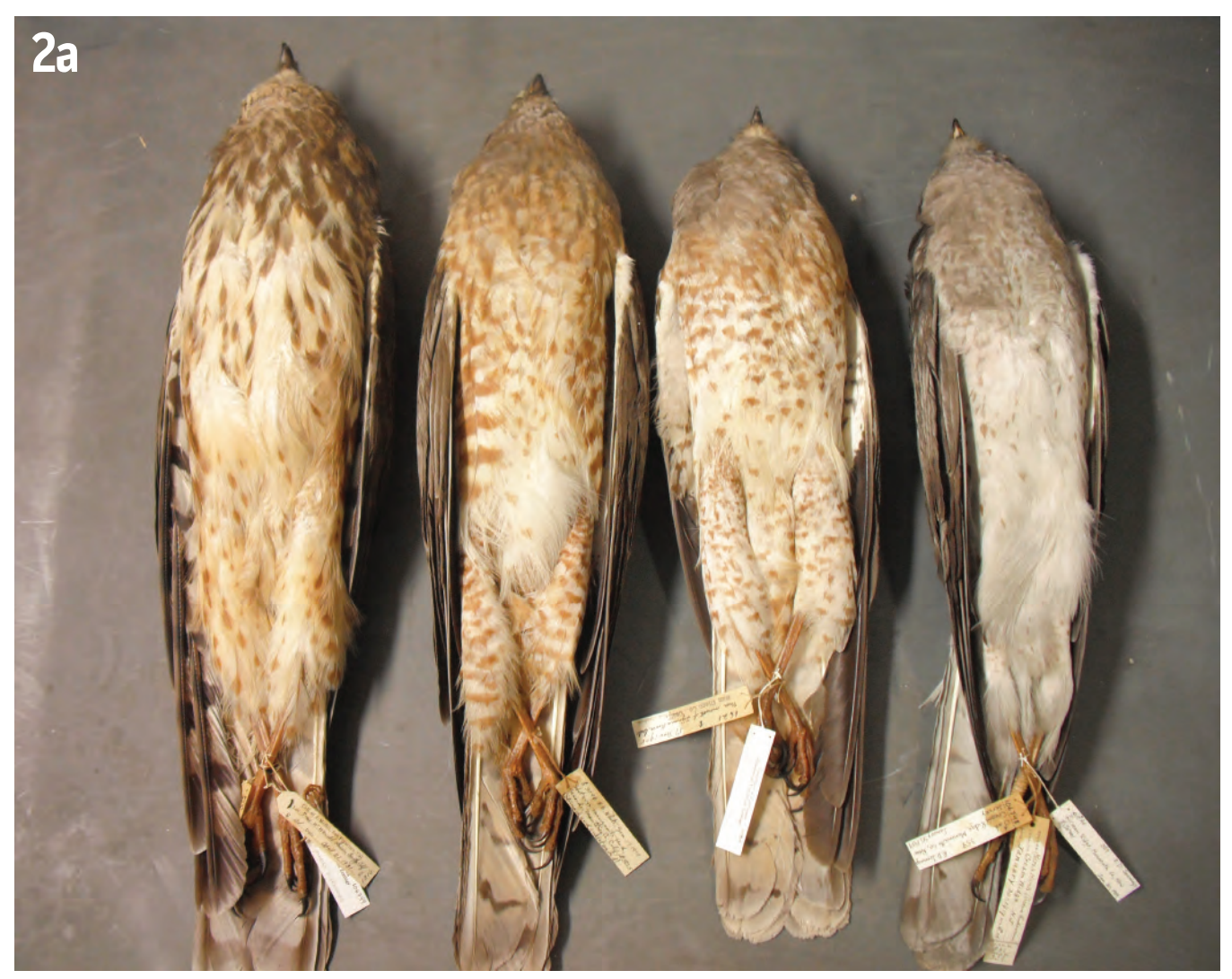
Fig. 2 (a, b). Shown here are specimens of Northern Harriers at the Museum of Vertebrate Zoology (MVZ), Berkeley, California. From left to right (Fig. 2a, ventral; Fig. 2b, dorsal): MVZ 106749, a female in typical brown basic body plumage; MVZ 30324, a probable female showing intermediate gray and brown body plumage; MVZ 4080, a male showing brown basic body plumage; and MVZ 106748, a male showing gray basic body plumage.

Murre, though, it might also result entirely from a molt– plumage interaction. In any case, darker feathering on the head and elsewhere was shown by a greater proportion of secondcycle basic-plumage murres than by older murres in basic plumage. I surmise that this is due to the second prebasic molt's averaging earlier in the season than later molts, a result of the fact that second-years do not breed and are "freed up" to molt earlier.