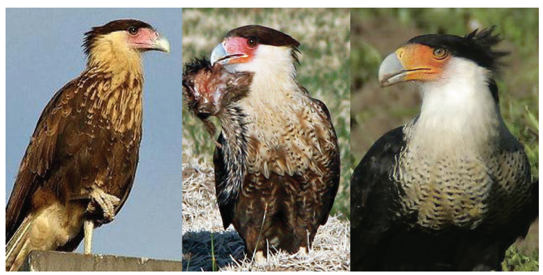
Figure 3. Crested Caracaras in California showing plumage variation used to identify molt cycle. The bird on the left was photographed 10 September 2006 (CBRC 2006-127) and has begun the second prebasic molt (so is technically in its second cycle) but still retains most of the plumage of the first cycle. The bird in the center, in its second cycle, was photographed 28 February 2008 (CBRC 2008-039). The bird on the right, photographed 17 September 2005, is in definitive plumage (CBRC 2005-100). Note the progression from browner plumage with indistinct buff breast streaks to intermediate plumage to blacker plumage with white and black bars on the breast.