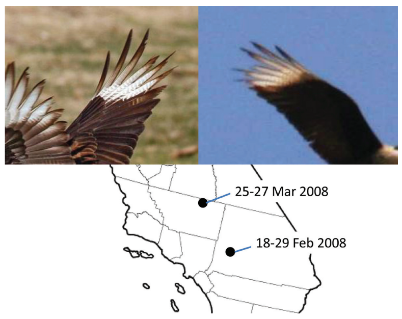
Figure 1. The notched P8, broken tip of P7, and the spiky P6 on the right wing confirmed the same individual in its second cycle (Table 1, ID #11) was photographed at Victorville, San Bernardino County, on 28 February 2008 (left) and then at the Kern River Preserve, Kern County, on 27 March 2008 (right).