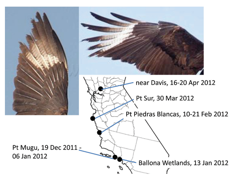
Figure 2. Adult Crested Caracara at the Ballona Wetlands, Los Angeles County, 13 January 2012 (left), and Piedras Blancas, San Luis Obispo County, 10 February 2012 (right). Note the large notch in the longest primary (P8), the fringed P7, and broken tip of P6 on the left wing in both images. These and other features indicated that this individual was first detected in Ventura County and subsequently observed and photographed in Monterey and Yolo counties (Table 1, ID #12), traveling north well over 800 km within 94 days.