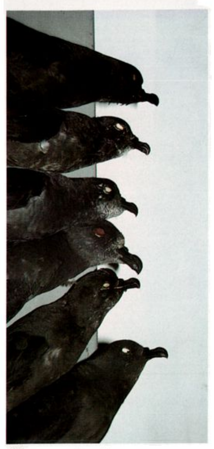
Figure 8. Heads and bills of (top to bottom) Herald, Herald, Murphy's, Solander's, Kermadec, and Kermadec petrels, AMNH. Top Herald is Atlantic form.