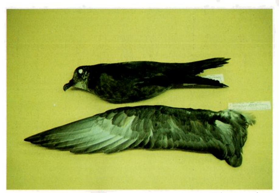
Figure 18. Study skin and spread wing of Murphy's Petrel collected 85 miles west southwest of Point Reyes, California, April 29, 1989. CAS 84182.

Little has been added to our knowledge of the breeding of the Murphy's Petrel since this species was described