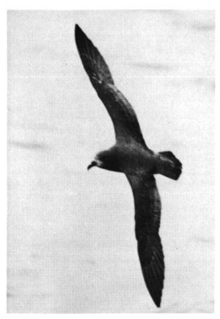
Figure 17. Solander's Petrel off Wollongong.

miles off of Point Reves. On the inbound transect of April 30, the density dropped between 75 and 50 nautical miles offshore (only three birds), but then we encountered 18 Murphy's Petrels between 50 and 32 miles southwest of Point Reyes. Most of these latter Murphy's were sitting on the water in loose association with Sooty Shearwaters. Nearly all the Murphy's were over water depths greater than 1900 fathoms, although the most landward was over about 1300 fathoms. The closest Murphy's were in the zone that represents the farthest offshore reached on the birding trips that have attempted to find Pterodroma petrels. It seems that only a few individuals are this close to shore, and that the main densities are much farther offshore in the eastern edge of the North Pacific Gyre.