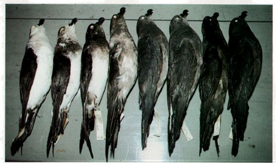
Figure 1. Plumage variation in Kermadec Petrel shown by specimens in American Museum of Natural History (AMNH), lateral view.

The very large collection of the American Museum of Natural History was especially useful in elucidating in-hand characters that can also be used in the field. It was examined independently by the three authors. Spear, accompanied occasionally by Pyle or Hansen benefitted from the knowledge gained during extensive seabird surveying and collecting in the Eastern Tropical Pacific for David G. Ainley (Point Reyes Bird Observatory). Pyle's personal field experience with this group includes many observations of all four species during fall