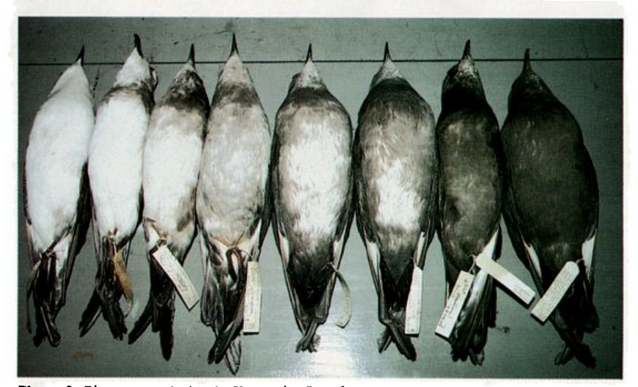
Figure 2. Plumage variation in Kermadec Petrel, same AMNH specimens, ventral.