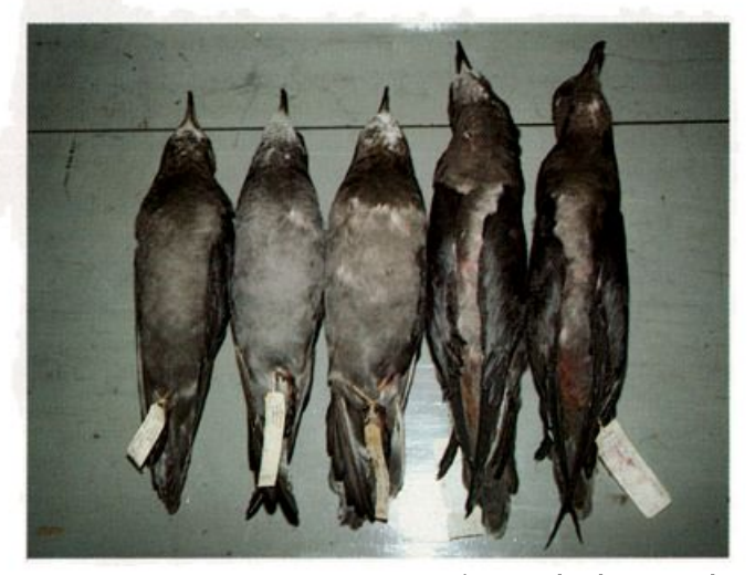
Figure 12. Three Murphy's Petrels and two Solander's Petrels, with both species appearing hooded, AMNH.