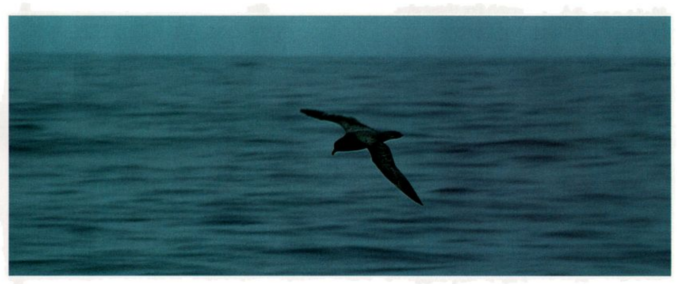
Figure 11. Murphy's Petrel showing faint upper primary shaft streaks, about 40 miles southwest of Point Reyes, April 30, 1989.

(Plate 1i; Figure 16). The tips of the latter are broadly dark, so that they form a conspicuous dark crescent separating the white primaries from the exposed white bases of the greater primary coverts (Figure 16). The remainder of the underwing is dark. Although the white extending out the primaries does not end quite so abruptly as on the Kermadec Petrel (Figure 6), the white patch does look fairly sharply defined all around, giving a highly contrasting appearance to the underwing pattern. This differs from the silvery flash of Murphy's Petrel; when the latter flashes "white" this effect usually blends farther out into the tips of the primaries and/or in-