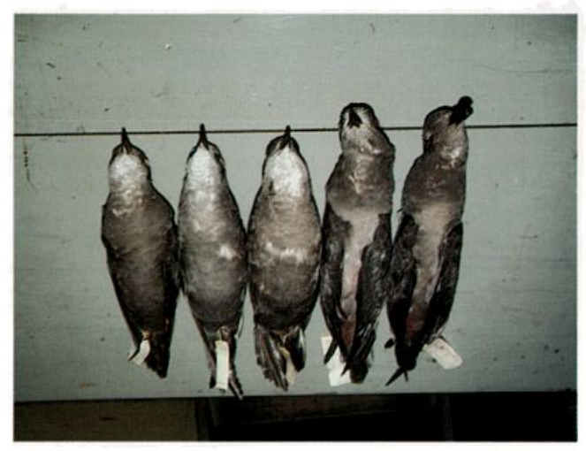
Figure 13. Same three Murphy's Petrels and two Solander's Petrels, at different light angle. Note that hooded effect disappears on Murphy's Petrel but remains on Solander's Petrel.

provide diagnostic characteristics between some species, but can only be used at fairly close range. Although such marks are not often needed by very experienced seabird observers, they can be important to the person looking for marks requiring less comparative judgement.