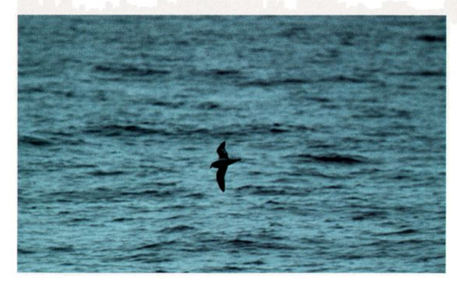
Figure 10. Same Murphy's Petrel, dorsal.

The Solander's Petrel is the largest of the four species, and it has a noticeably larger bill (Plate 1; Figure 8). Pale or mottled white normally encircles the base of the bill, but it never forms a distinct white throat as in the Murphy's Petrel. Most of the plumage including the underparts is brownish gray, but the back is the same medium blue-gray as in Murphy's Petrel. The effects of wear and molt on Solander's back color parallel those in Murphy's.