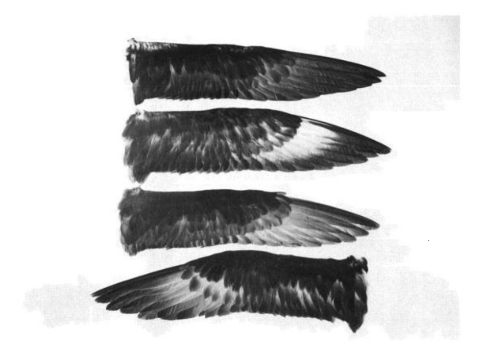
Figure 6. Underwings of (top to bottom) dark-morph Herald Petrel (LACM 104360), dark-morph Kermadec Petrel (LACM 104357), Murphy's Petrel (LACM 104356), and Solander's Petrel (LACM 102806).

The Herald Petrel is the smallest of the four species. Its bill is slightly more delicate than in the Kermadec, and its head, body, and wings are all notice-