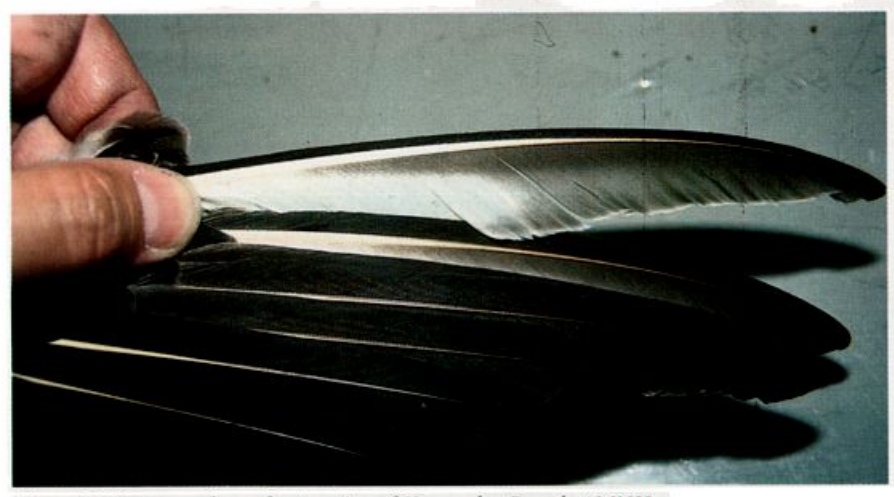
Figure 5. Upper surface of primaries of Kermadec Petrel, AMNH.

are either bicolored or all black. Bicolored feet are light-colored (usually flesh) on the tarsus and proximal metatarsus, with the remainder of the foot black. Foot color has been thought to be an important character in distinguishing these species, but in fact we found that all four species can have bicolored feet and three can have allblack feet. Only Murphy's Petrel seems constant in its foot color, which is bicolored flesh and black. In both the Kermadec and Herald petrels the paler morphs have bicolored flesh and black feet but the darker morphs have either bicolored or all-dark feet, as shown by specimens (Bailey pers. obs.). The feet of most Solander's Petrels are uniform black or dark gray, but instead they may be bicolored blackish and yellowish (Murphy and Pennoyer 1952). We do not use foot color for field identification of these species.