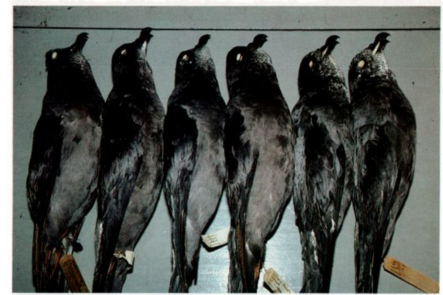
Figure 14. Six Murphy's Petrels, showing variation in face pattern, AMNH.

Most Murphy's Petrels were flying north northwest, generally parallel to the coast, suggesting a concerted northward migration. Densities were greatest in the waters 80 to 90 nautical