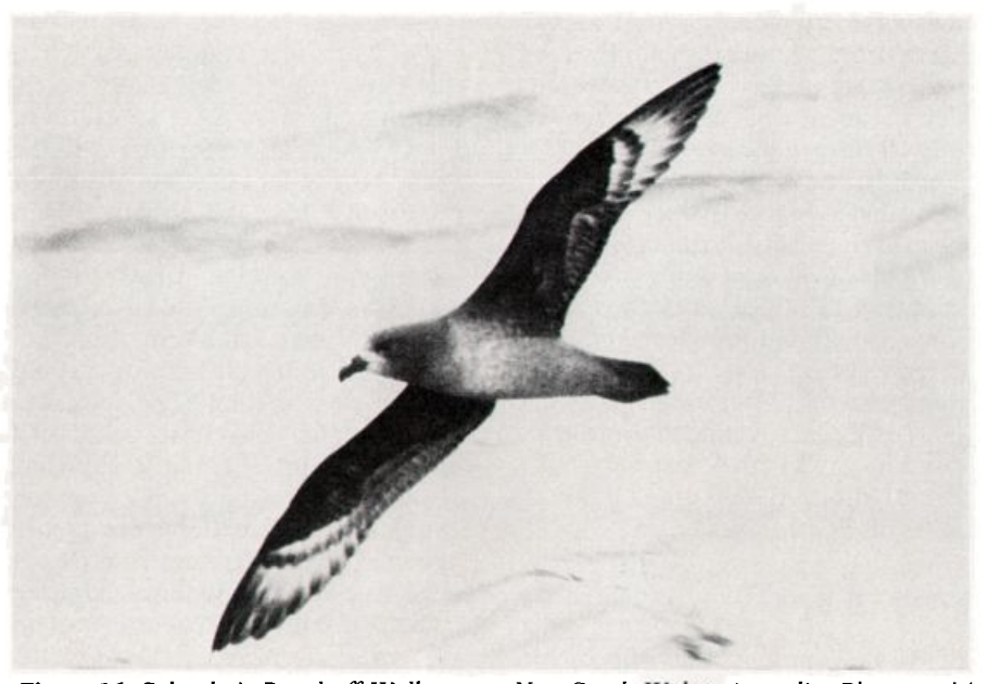
Figure 16. Solander's Petrel off Wollongong, New South Wales, Australia. Photograph/Chris Corben.