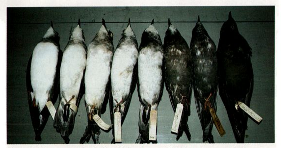
Figure 4. Plumage variation in Herald Petrel, same AMNH specimens, ventral.

(P. macroptera), Kerguelen Petrel (P. brevirostris), and the Soft-plumaged Petrel (P. mollis) are widespread, but the dark morph of the Soft-plumaged is rare. The Mascarene Petrel (P. aterrima) and Fiji Petrel (P. macgillivravi) were only recently rediscovered and remain little-known. None of these species has been recorded north of 18°S in the Pacific; for their identification see Harrison (1985, 1987). Two other genera are easily distinguished from the species we treat. Bulwer's Petrel (Bulweria bulwerii) and Jouanin's Petrel (B. fallax) are considerably smaller and have long pointed tails. The four species (three dark) of the genus Procellaria are larger and shaped more like large fulmars (Spear pers. obs.).