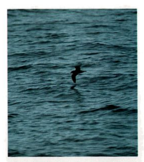
Figure 9. Murphy's Petrel 67 miles west southwest of Point Reyes, California, April 30, 1989.