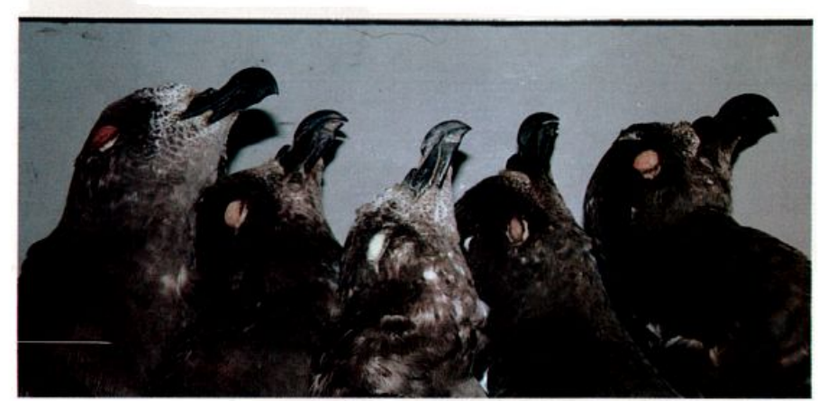
Figure 15. Five Solander's Petrels, showing variation in face pattern, AMNH.