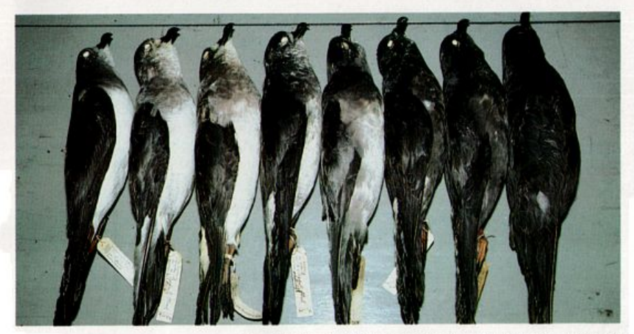
Figure 3. Plumage variation in Herald Petrel, AMNH specimens, lateral view. Darkest bird is Atlantic form.